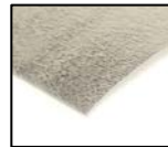
2mm or 3mm Silver